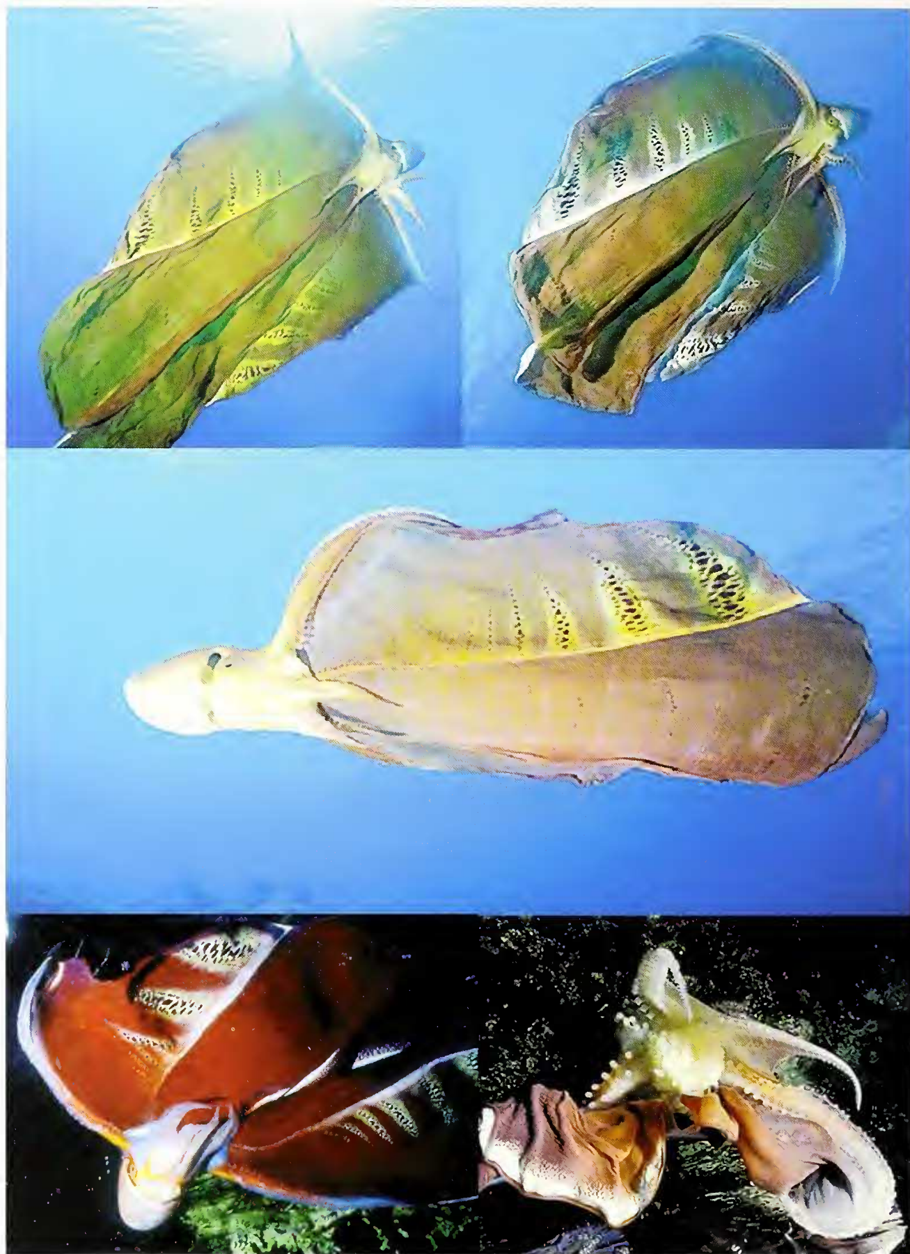
Fig. 1. The female Tremoctopus of Ponza in the photographic sequence by Conticelli and Pellicciari. Both colour changes and different extensions of the web can be appreciated; in the lower right corner the egg mass is visible.